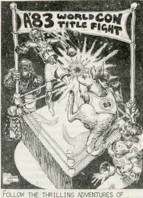
AUSSI ROO AND HIS MIGHTY MARSUPIALS IN AUSTRALIAN SCIENCE FICTION NEWS

Please send $3.00 to P.O.Box J 175 Brickfield Hill 2000, N.S.W. AUSTRALIA